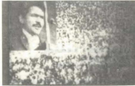
Mr. Massoud Rajavi, the leading member of the People's Mojahedin and the Chairman of the N.C.R.

The setback of August of 1971, severe as it was, however, did not destroy the Mojahedin. On the contrary, by virtue of their strong organizational infra-structure, the Mojahedin reorganized and continued the struggle. In the Spring of 1972, the regime tried and sentenced