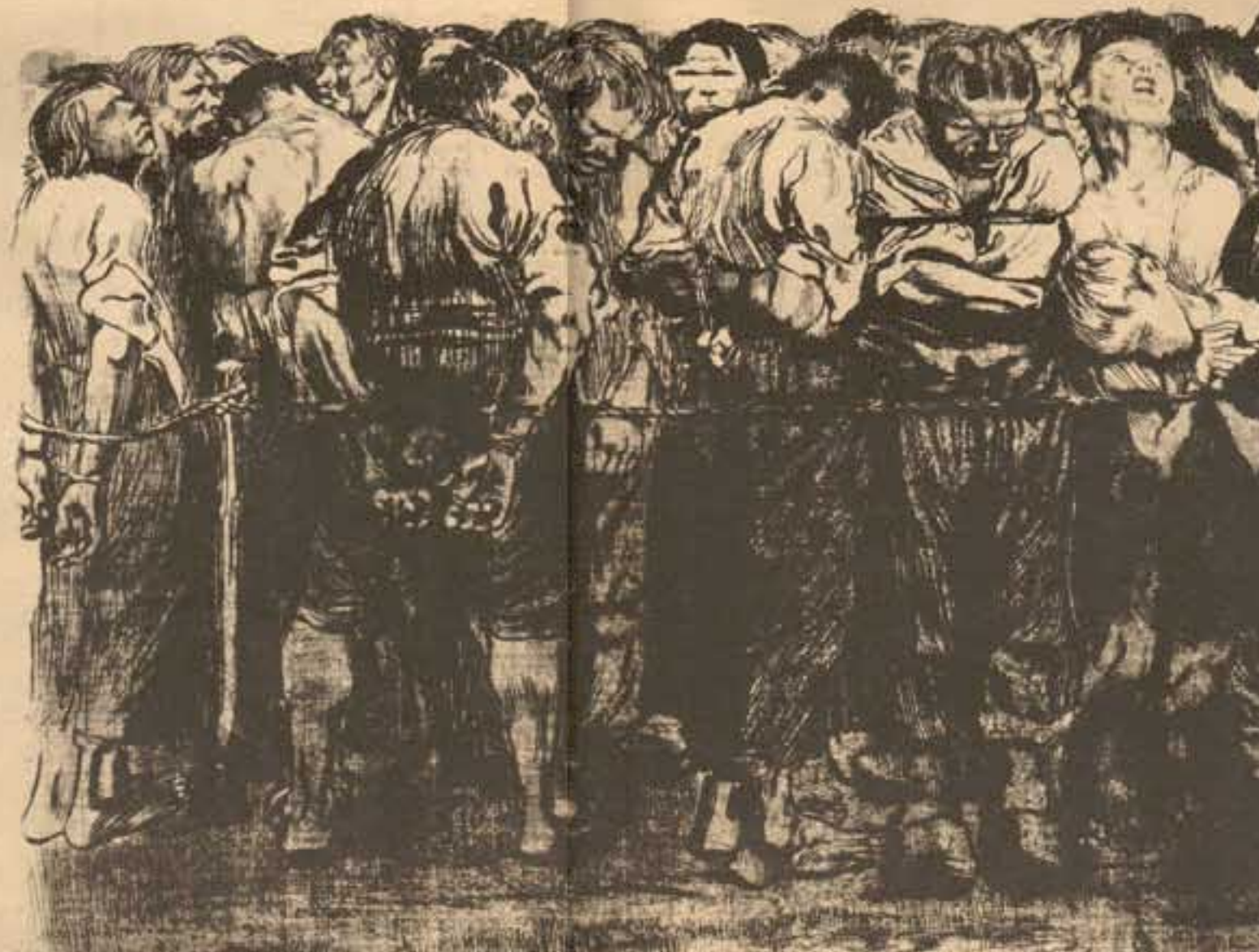
The Prisoners by Kathe Kollwitz