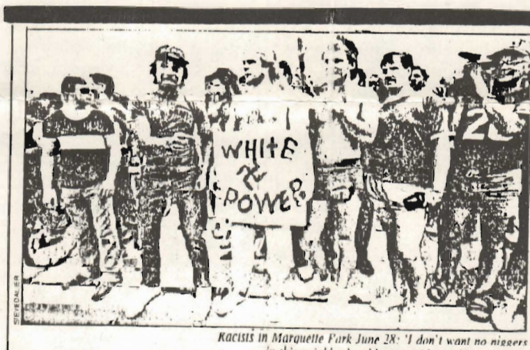
Racists in Marquette Park June 28: 'I don't want no niggers in this neighborhood,' one resident told a reporter.

A black youth in Zion was shot and killed at a carnival by a white man who was, according to bystanders, looking to attack a black person.