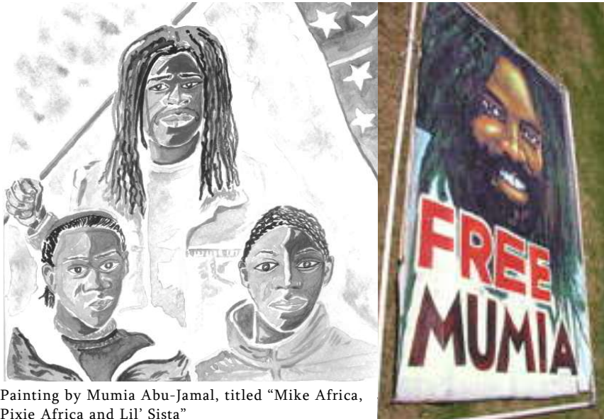
Painting by Mumia Abu-Jamal, titled "Mike Africa, Pixie Africa and Lil' Sista"