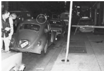
The photos above and below show that Officer Faulkner's hat was moved from the top of the car to the sidewalk for police photos.

With news media brushing off 'hot-button' items like pain, the brush-off of crime scene photos is somewhat understandable.