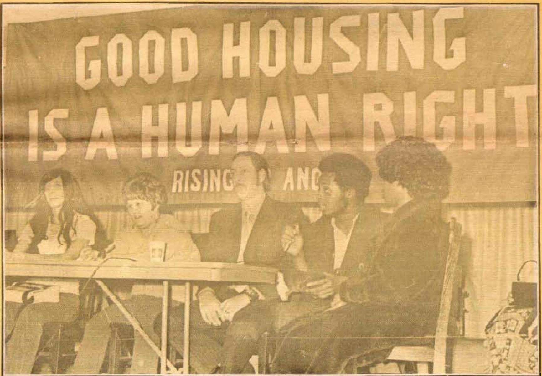
SOME OF THE WITNESSES WHO GAVE TESTIMONY AGAINST THE SLUMLORDS, THE GUTMAN BROTHERS, AT THE "PEOPLE'S TRIBUNAL"—OVER 400 PEOPLE WERE THERE.

IT IS CLEAR THAT THE WHOLE SYSTEM WE ARE FORCED TO LIVE UNDER PUTS THE PROFITS OF THE FEW OVER THE LIVES OF THE MANY. THE ONLY WAY WE WILL STOP THIS IS BY BLACK, WHITE, BROWN, YELLOW, RED, YOUNG, OLD, ALL THE PEOPLE, GETTING TOGETHER AND FIGHTING FOR BETTER HOUSING, BETTER WORKING CONDITIONS AND BETTER LIVES.