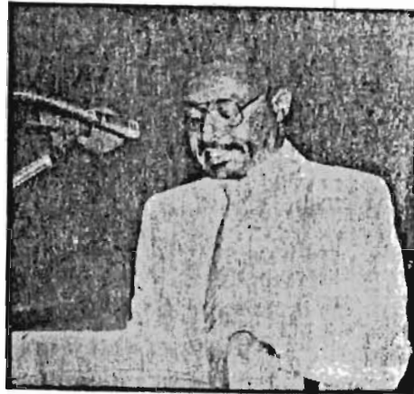
The APLA Commander-in-Chief

The PAC, he said, took seriously threats made recently by racist defence minister General Magnus Malan against the Frontline States.