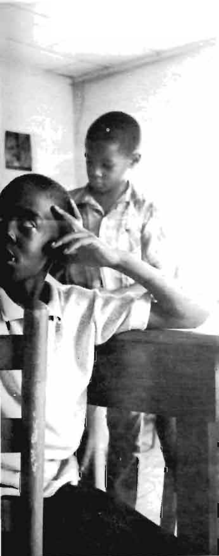
a poor black boy. "I am a