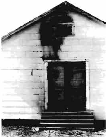
WILLIAMS CHAPEL CHURCH IN RULEVILLE, the site of voter registration meetings sponsored by SNCC, was damaged by fire on June 25.

Harmony (Carthage), June 30 - The (white) county superintendent of schools suddenly announced a