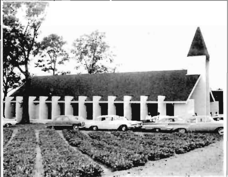
THE NEW MOUNT OLIVE BAPTIST CHURCH in Sasser, Georgia was re-dedicated two weeks ago. The church - and two others near here - were burned down by nightriders two years ago while SNCC was using them for voter registration meetings.

"We see the Freedom Schools and community centers as a natural part of our voting program," SNCC Executive Secretary James Forman said. There are more SNCC staff members in Mississippi than other rights groups have throughout the South.