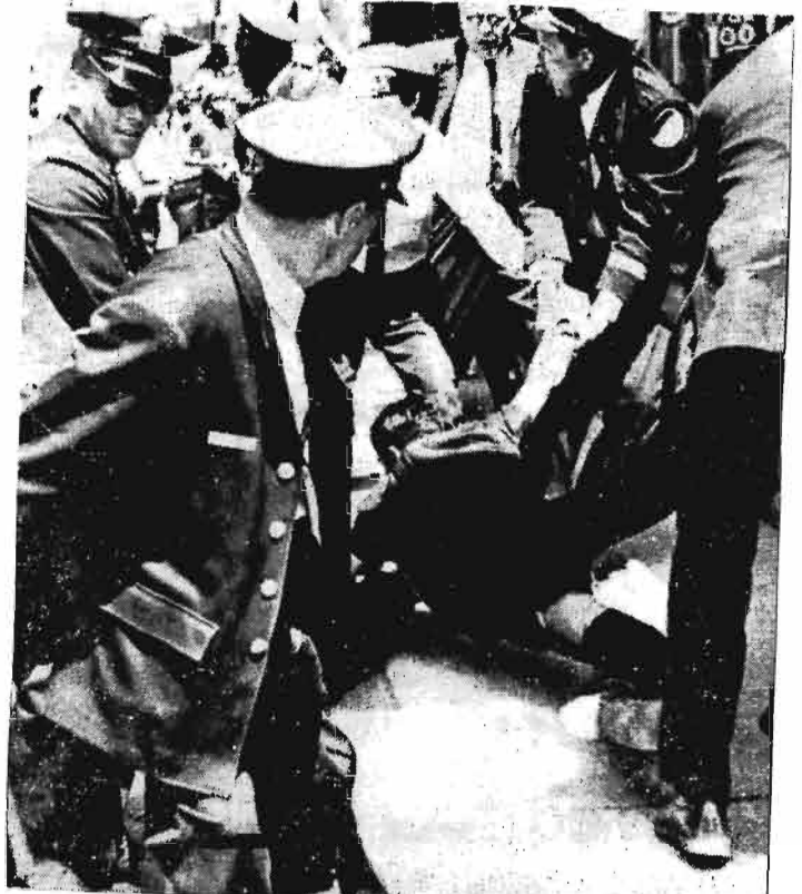
Nashville police pull protester during demonstrations.