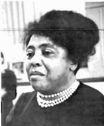
Mrs. Fannie Lou Hamer