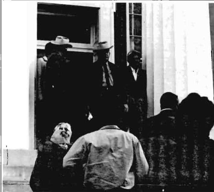
CANTON NEGRO CITIZENS face Mississippi law officers as they attempt to enter the courthouse to try to register on Freedom Day.