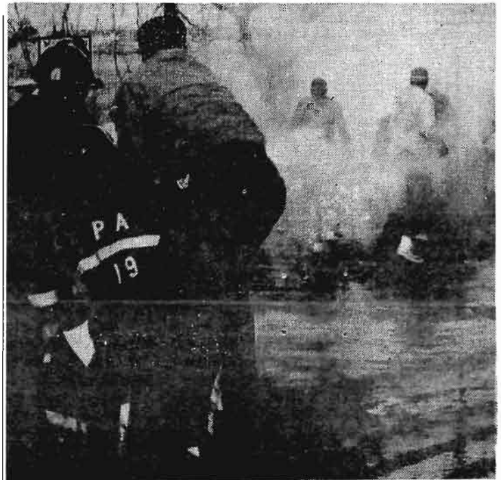
Princess Anne firemen turn hoses on Maryland State College students to halt demonstrations.