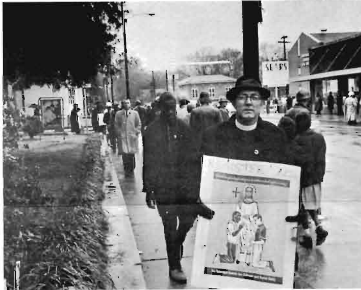
Pickets in front of courthouse in Hattiesburg, Miss.

Four religious groups which are sponsoring the presence of clergymen here were named in the injunction. They are: The