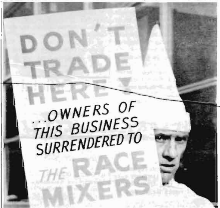
One of many Klansmen that demonstrators must face