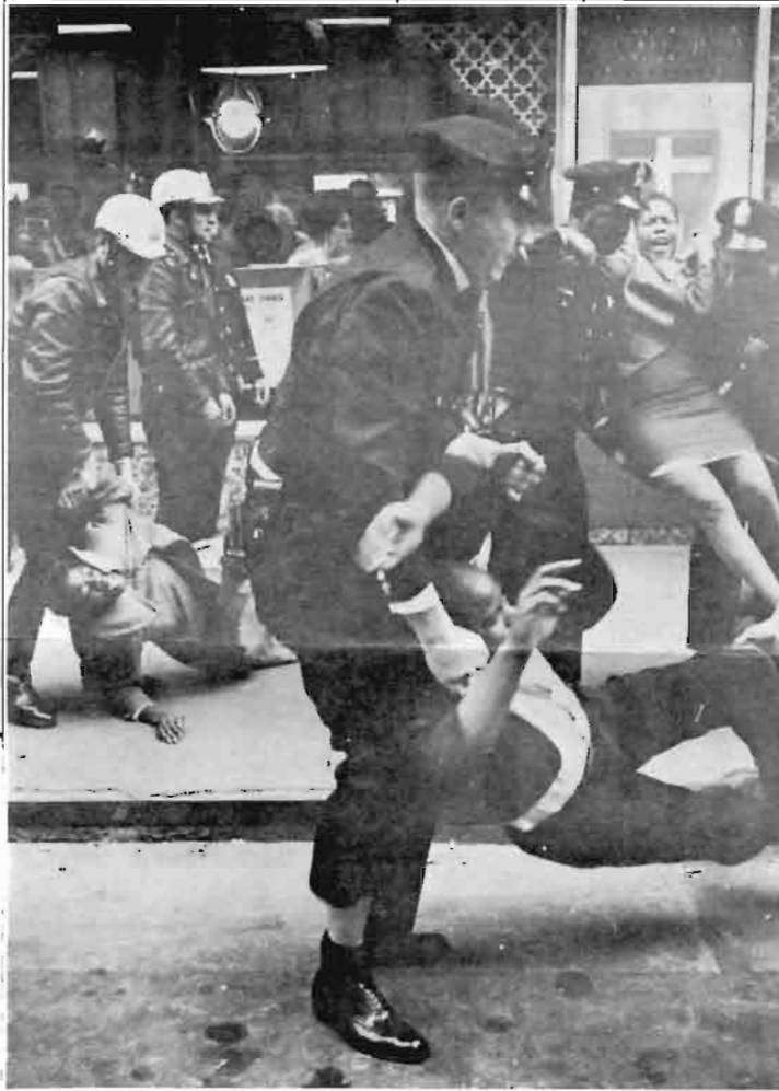
Atlanta policemen arrest students in demonstration.