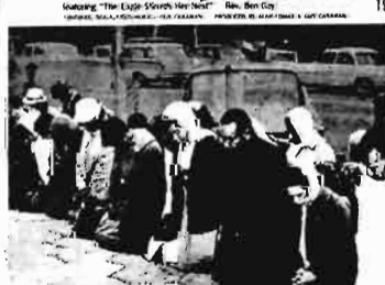
FREEDOM IN THE AIR, a documentary record on Albany, Georgia is available from SNCC'S Atlanta Office, 6 Raymond Street, Atlanta, Georgia,

They are the first Negroes to seek public office in Selma since Reconstruction.