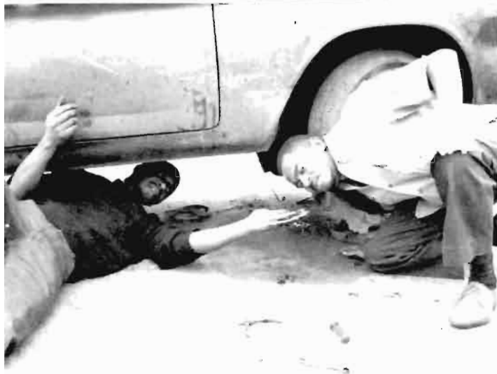
SNCC WORKERS EXAMINE syrup poured into a vote worker's car while Hattiesburg, Miss. police had possession of it. The United States Department of Justice had been asked to investigate the car's sabotage.