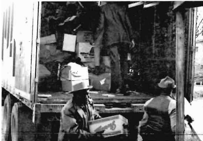
TEN TONS OF FOOD AND CLOTHING arrive in Ruleville, Miss., or Negroes facing reprisals because of their activity in the voter registration drive.

SNCC Chairman John Lewis said "many Negro Mississippians lose their jobs and homes each year because they try to vote."