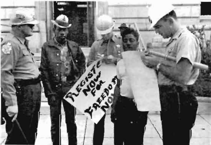
WORKERS ARRESTED ON FREEDOM DAY See Page 3