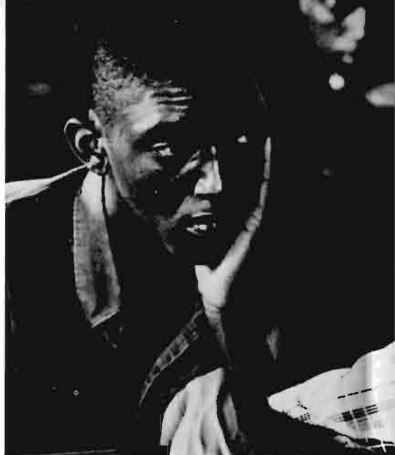
Left: at a non-violent workshop. Bottom: waiting in vain to be admitted to a Danville restaurant.