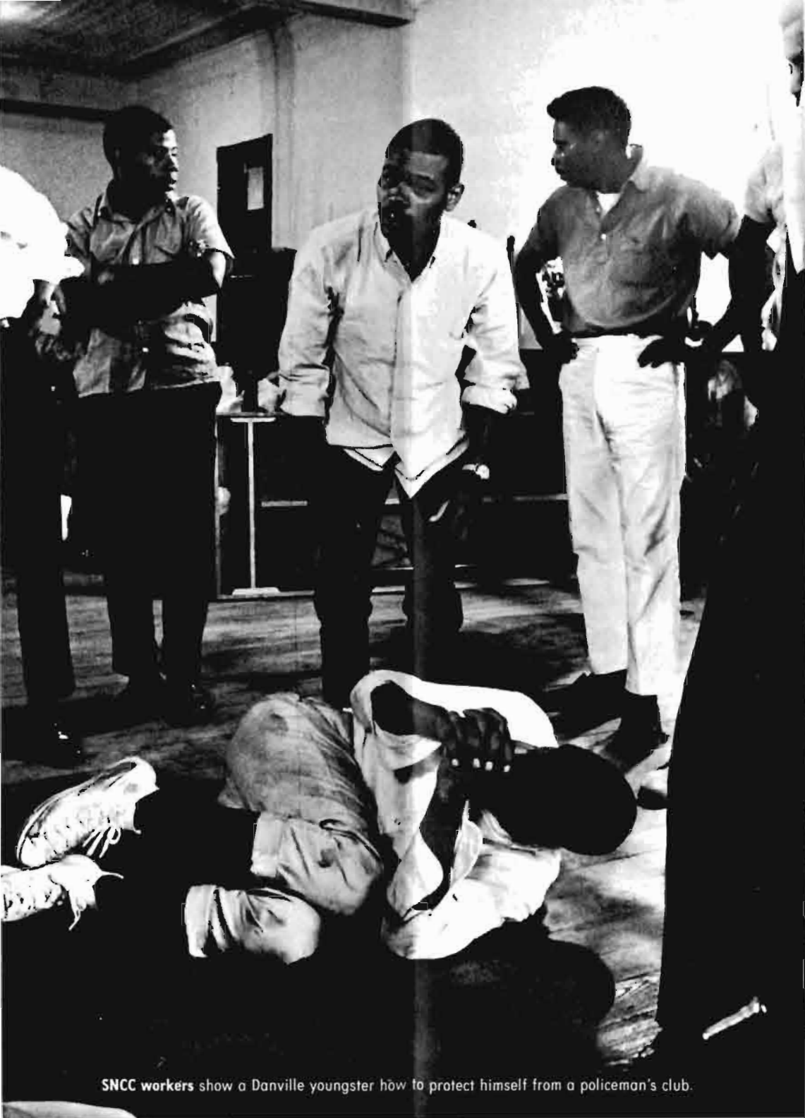
SNCC workers show a Danville youngster how to protect himself from a policeman's club.