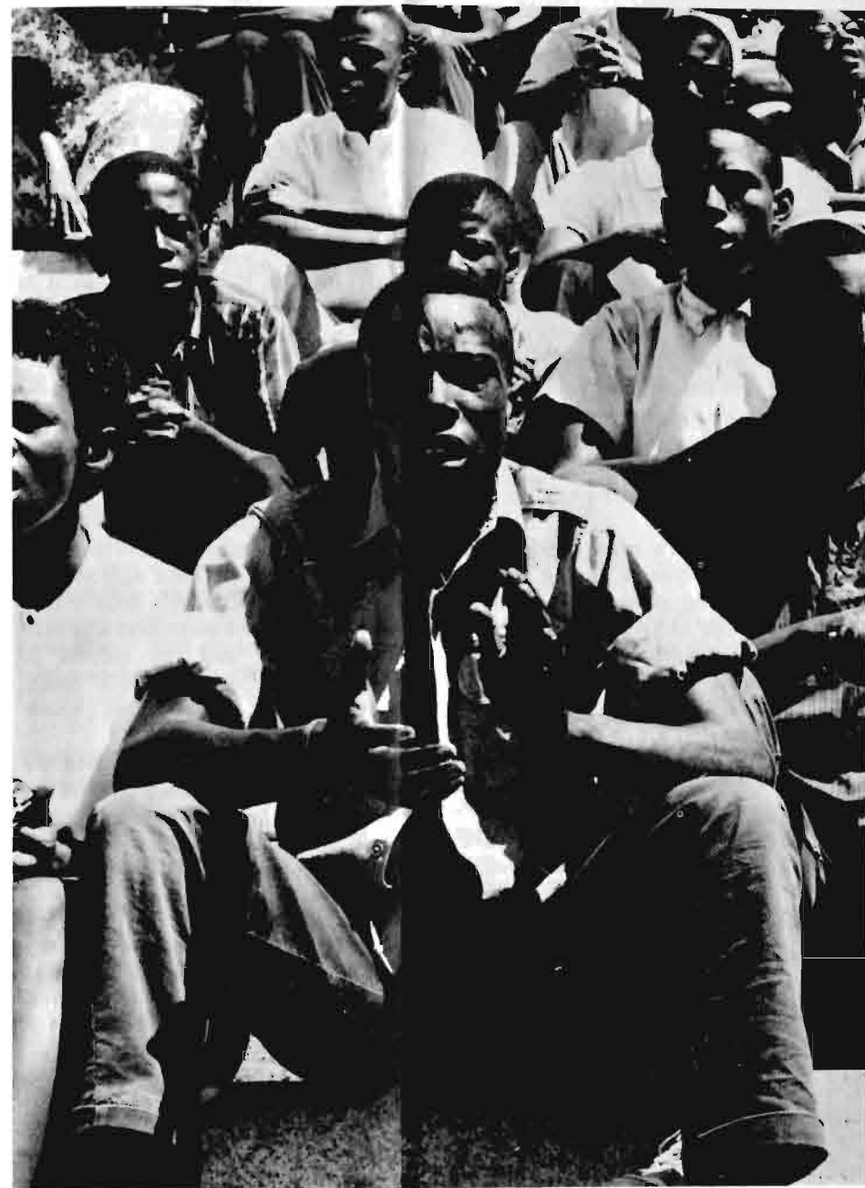
On the steps of the City Hall.