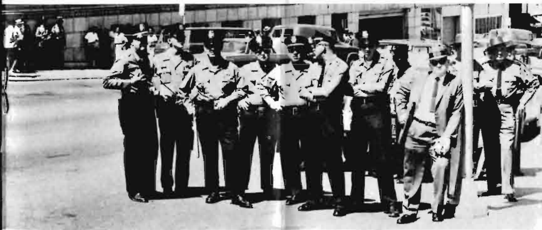
Monday afternoon, June 10: a prelude to what came later that evening.