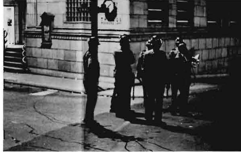
And so the people reluctantly left the steps of the City Hall.