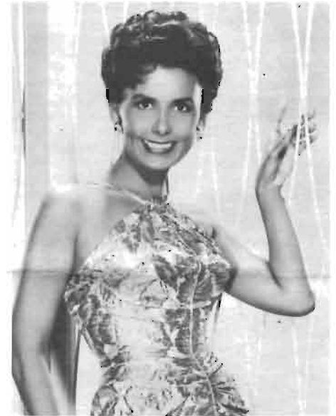
First appearance for Lena Horne

Also sharing the spotlight with Miss Horne will be the talented and much-publicized trio of Lambert, Hendricks & Bavan, who first gained fame for their unique imitations of musical instruments and scat singing with Count Basie's orchestra several years ago. Accompanying Miss Horne will be a 23-piece orchestra under the direction of Mercer Ellington, son of the famous composer-bandleader Duke Ellington.