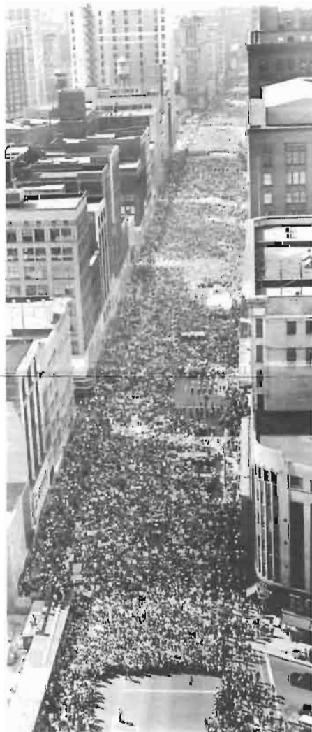
Mighty mass of humanity spills all over downtown Woodward Ave., in Detroit as thousands joined parade, singing hymns and spirituals.

So impressive was the great swarm of humanity that the Detroit daily newspapers were