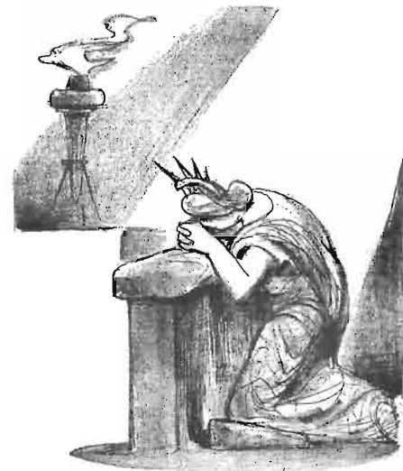
Burck in Chicago Sun Times