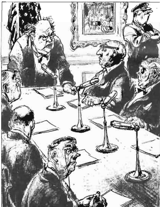
"And while you gentlemen was wastin' yo' time talkin' about givin' the Niggas civil rights . . . they went and did away with Santa Claus!"