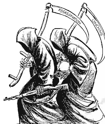
Mauldin in the Chicago Sun Times