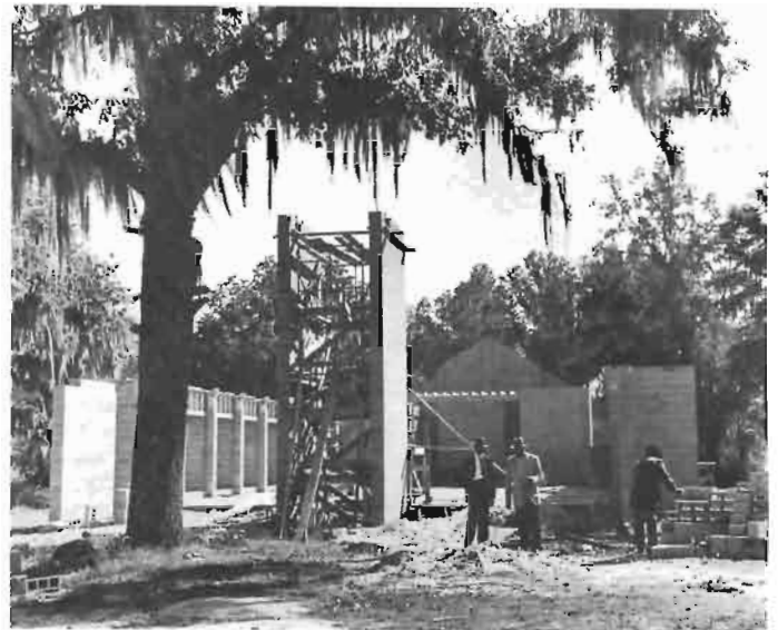
VANDALISM BEFORE COMPLETION—Although construction of churches is still going on, vandals already have tried to halt their completion. Thirty-foot pier like that shown above was yanked down recently during night at Mount Mary Church in Terrell County, Georgia.

We are anxiously looking forward to the completion of the churches. The cost of construction is $95,000 exclusive of furniture and equipment. This means with approximately $50,000 in SCLC's fund and another $25,000.00 in other funds and insurances, we are still $20,000.00 shy of the funds needed to clear construction costs completely. We are hoping that our many readers who may not have contributed to the church rebuilding fund will supplement the deficit we now face. Checks may be made payable (tax deductible) to Mt. Olive Baptist Church Rebuilding Fund, c/o Jackie Robinson — 425 Lexington Avenue, New York City or direct to the SCLC home office in Atlanta.