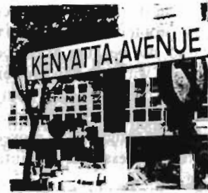
WHERE IN THE WORLD WILL YOU FIND STANDARD CHARTERED?

Offhand I can't think of any country however dictatorial its system, where you can't write sycophantic songs extolling the State's armed might and expressing the joys of that particular country in terms of the highest conceivable adulation.