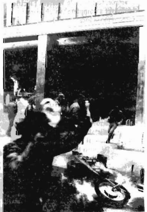
Members of Parisian autonomous groups demonstrating against Argentinian repression and the World Cup. Over 400 people armed with metal bars and molotov cocktails clashed with police at the end of May. (Liberation).

The confused state of the autonomous groups reflects their origins in the failure of French maoism, and while some are gravitating towards a gut-level anarchism, others have not abandoned their authoritarian attitudes, but seek to compensate for their failure by attacking others on the left.