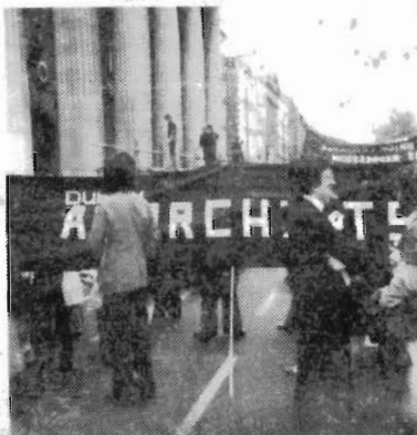
A Touch Of History - Dublin's first Anarchist May Day parade was outside the Dublin Post Office - where the Republic was proclaimed in 1916 during the Rebellion.

Now Available: COSMIC TRIGGER! Final Secret of the Illuminati , Robert A. Wilson, £4.00 (inc. p&p).