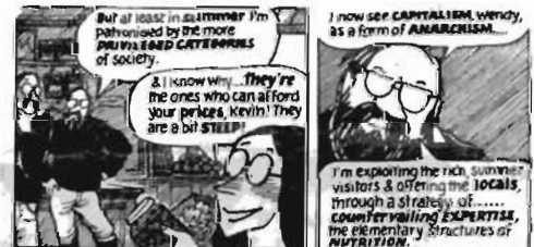
From a comic strip in the Guardian - a caricature of a caricature.

undoubtedly hinting at is the unfortunate nationalism over the years of the Spanish comrades who, in their preoccupation with the problems of exile and resistance, have so largely ignored the pursuit of the new life offered to them by the democracies since 1945. Freedom, while not actually speaking out against this nationalism, has consistently opposed it, either with the occasional unfavourable inference, or simply by maintaining silence about the resistance to Franco.