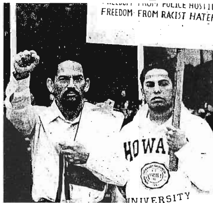
ARRIBA: Dos manifestantes protestan por los presos hispanos que han sido castigados por haber organizado una huelga de hambre en diciembre de 1999.