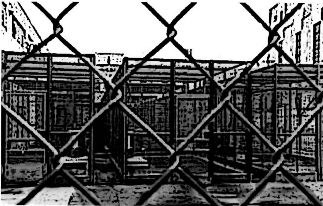
Exercise cages, San Quentin (Artist: Kendal Au)

The total number of people in long-term lock down in California on a given day exceeds 14,600