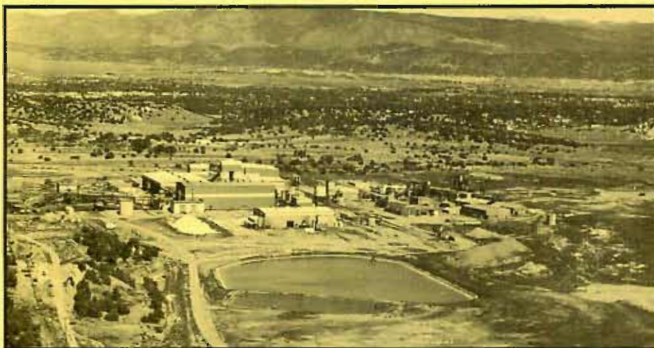
Leaking tailing ponds at Cotter Uranium Plant