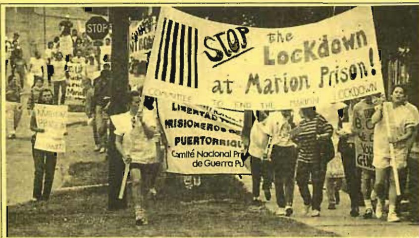
Pickets protest Marion lockdown