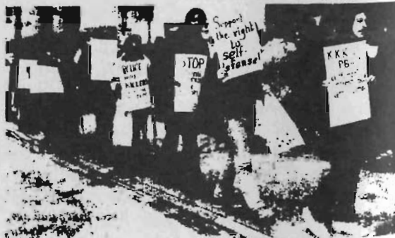
Demonstration by Black & Latino Coalition Against Police Brutality, NYC, 1979