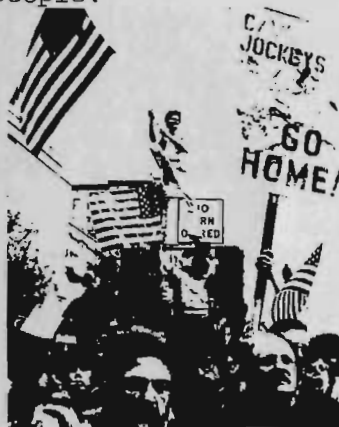
anti-Iranian mob: white supremacist war mongering.

Recently, in Los Angeles, the Jewish Defense League (JDL) and American Nazi Party joined ranks in an anti-Iranian demonstration. The joining together of two forces which claim to be diametrically opposed may seem at first to be contradictory. But, the so-called "Iranian crisis" has only surfaced the fundamental unity of white supremacy and Zionism. For weeks, white mobs have been attacking Iranian people in the U.S.; the INS (Immigration and Naturalization Service) has been conducting witch-hunts against Iranian students on college campuses; and the mass media has been drumming up war fever through scare-headlines and jingoistic editorials. U.S. imperialism cannot stand to see the Iranian people exercising their right to self-determination. And, from all corners, white supremacist forces are banding together to defend the Shah, one of the worst war criminals in history. The Shah is a brutal murderer and should be returned to face the justice of the Iranian people!