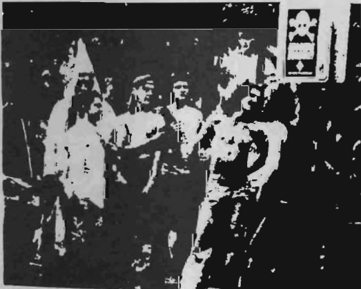
White gang attacking Black people in Marquette Park, Chicago.

In New Jersey, we can see the Klan implementing three parts of its national strategy: consolidation on the national level; organizing among