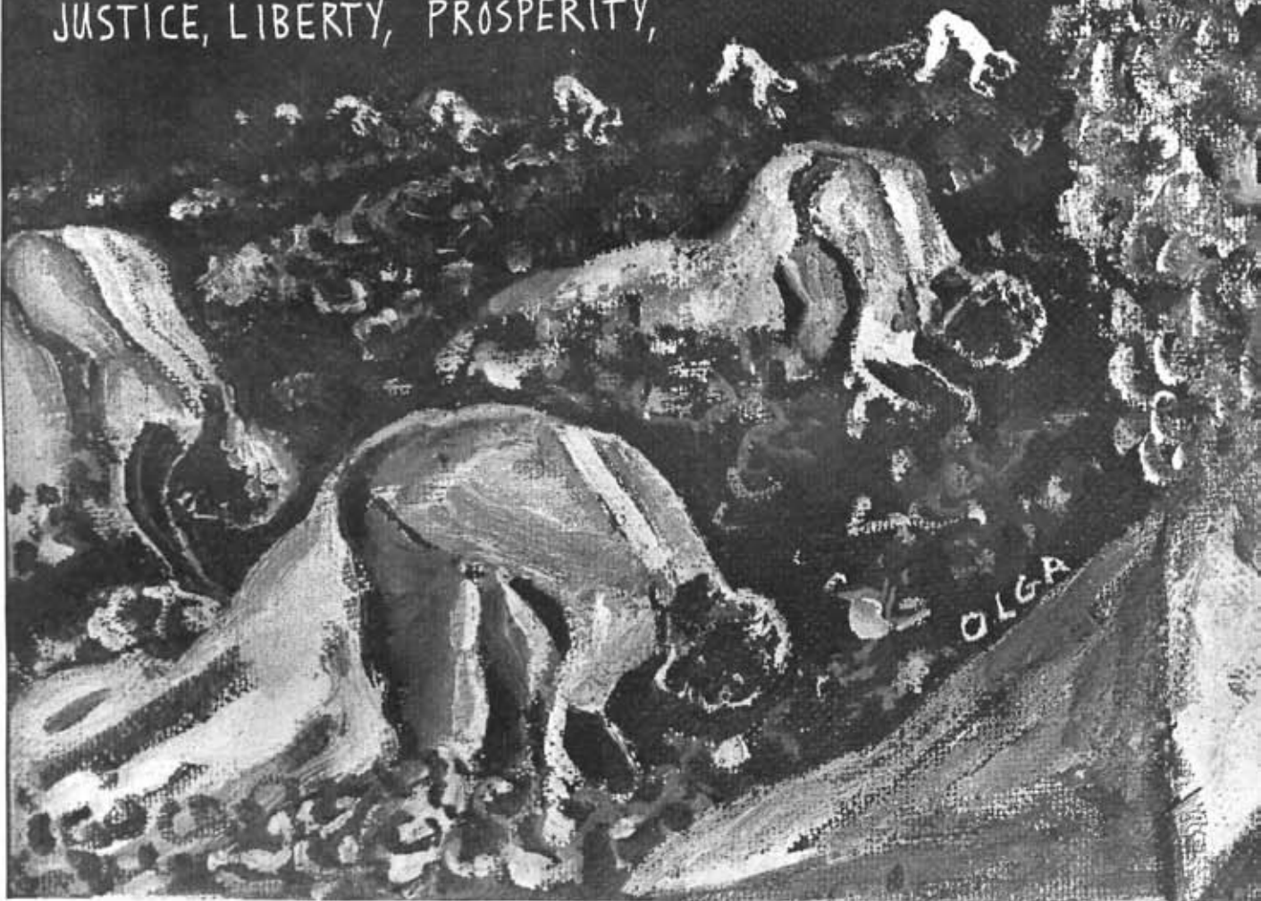
WEATHER UNDERGROUND ORGANIZATION

BUT SUCH IS NOT THE CASE. I AM NOT INCLUDED WITHIN THE PALE OF THIS GLORIOUS ANNIVERSARY. THE RICH INHERITANCE OF JUSTICE, LIBERTY, PROSPERITY,