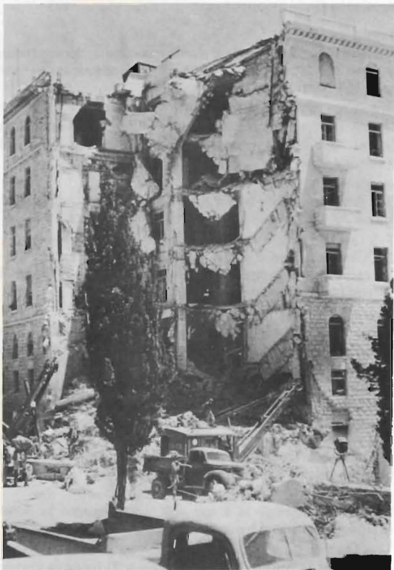
The blowing up of the British headquarters at the King David Hotel in Jerusalem (1946) by Zionist terrorists

the post office sorting room in London, injuring 2 persons. It was attributed to Irgun or Stern Gangs. (The Sunday Times, Sept. 24, 1972, p.8)