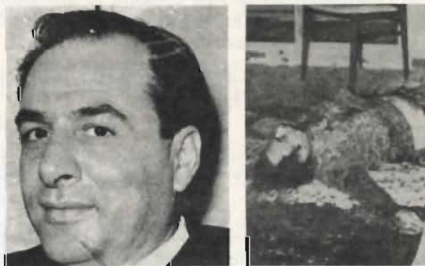
Kamal Nasser, one of Palestine's foremost poets, was gunned down and killed in his home in Beirut on April 10, 1973 by the Israeli special forces and terror squads.