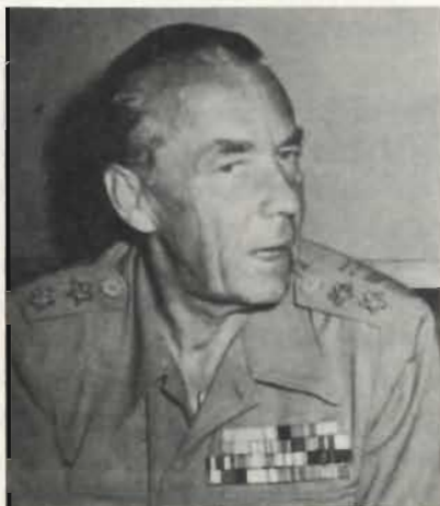
Count Folke Bernadotte assassinated by the Israelis on September 17, 1948

Count Folke Bernadotte, UN Mediator in Palestine was assassinated by members of the Stern Gang in the Israeli-controlled sector of Jerusalem. Bernadotte's aide, Col. Serot, was also killed.